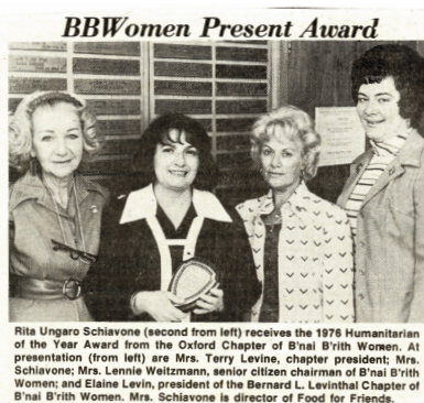
This photo includes the Founder of CFF (Aids for Friends) and donors.

www.caringforfriends.org Sign-up for our e-newsletters